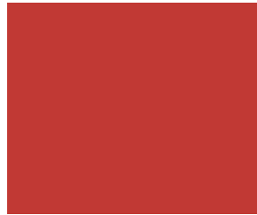
Crimson Red WXR00084

SR .35 TE .86 SRI 37 SR .29 TE .86 SRI 29